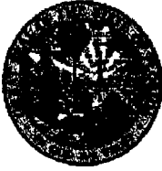
Exhibit 2 - Signed Current School Permit License